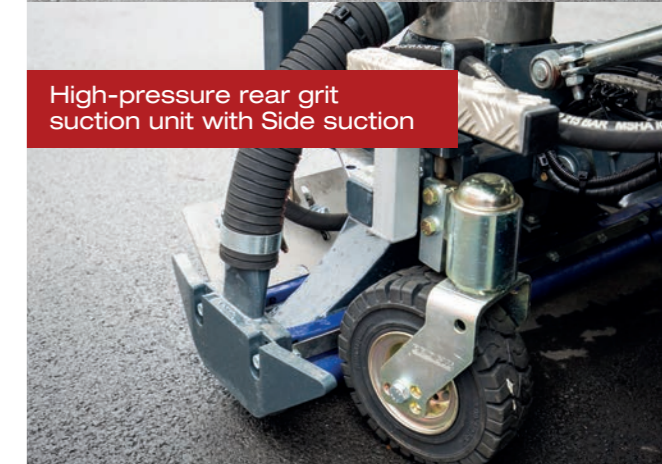
High-pressure rear grit suction unit with Side suction

Your sweeper as individual as you are - that is our strength. We find the perfect solution for your cleaning work. With a multitude of possibilities and variations, your machine becomes the ultimate cleaning professional. Please contact us or write to us: sales@brock-kehrtechnik.de